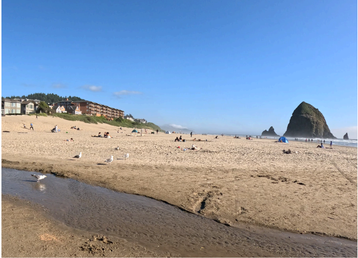
Haystack Rock, Oregon, June 2025